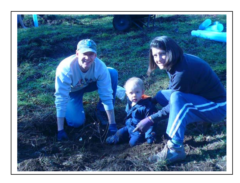
Volunteers Visit Restoration Site to Plant for Phase 2 & 3