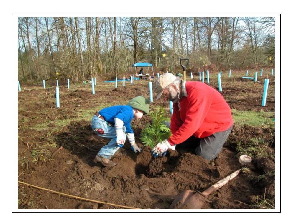
Volunteers planted approximately 700 native trees for Phase I