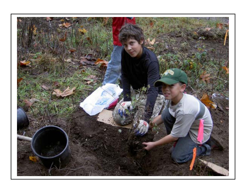
Watershed Education Program, Lundy Watershed Rangers, visit restoration site with their parents to plant for Phase 2 & 3